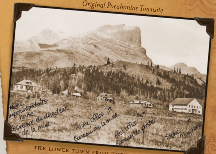
Original Pocahontas Townsite

SOME PEOPLE KEPT A FEW COWS AND CHICKENS