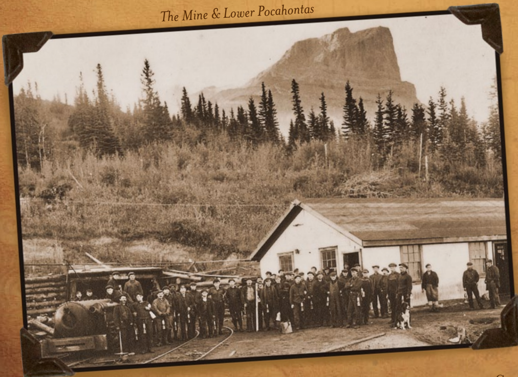
The Mine & Lower Pocahontas

"WE PICKED OUR WAY THROUGH THE COAL SEAM FOR LESS THAN TEN DOLLARS A DAY."