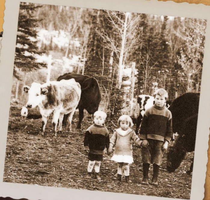
SOME PEOPLE KEPT A FEW COWS AND CHICKENS