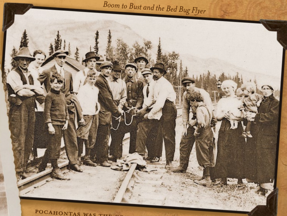
Boom to Bust and the Bed Bug Flyer