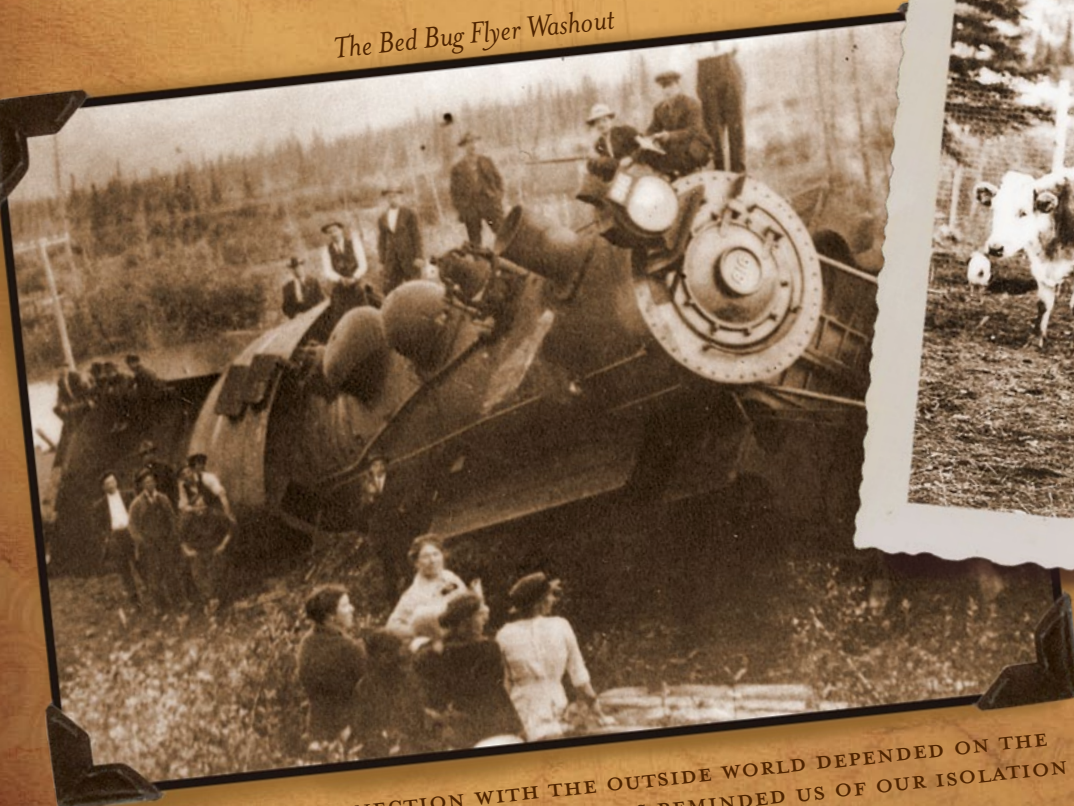
OUR CONNECTION WITH THE OUTSIDE WORLD DEPENDED ON THE RAILWAY. OCCASIONAL WASHOUTS REMINDED US OF OUR ISOLATION